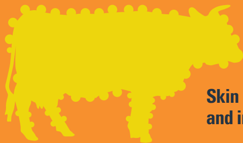
Skin nodules and internal lesions