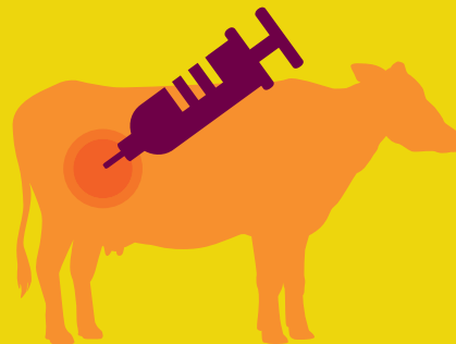
Vaccination (Neethling-like strain)