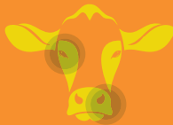
Ocular and nasal discharge